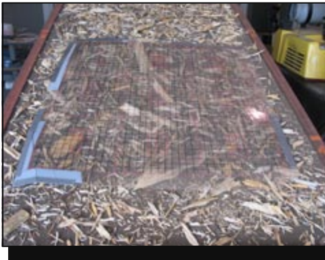
Figure 7—A Plexiglas sheet was used to determine the percent coverage of shavings.