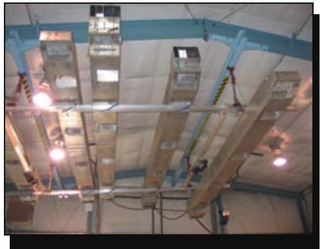
Figure 1—A Purdue-style rain simulator mounted on the ceiling of the Rocky Mountain Research Station's laboratory in Moscow, ID.

The procedure for testing erosion is to run the rain simulator continuously for 25 minutes at 50 millimeters per hour