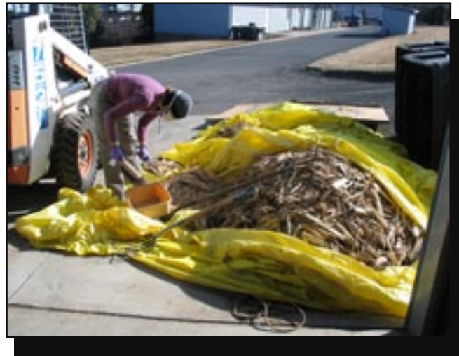
Figure 4—Sampling wood shavings to be tested.

wood shavings (figure 4) were produced using lodgepole pine logging slash from the Mill Creek Drainage near Missoula, MT. The material was sampled and a graph was