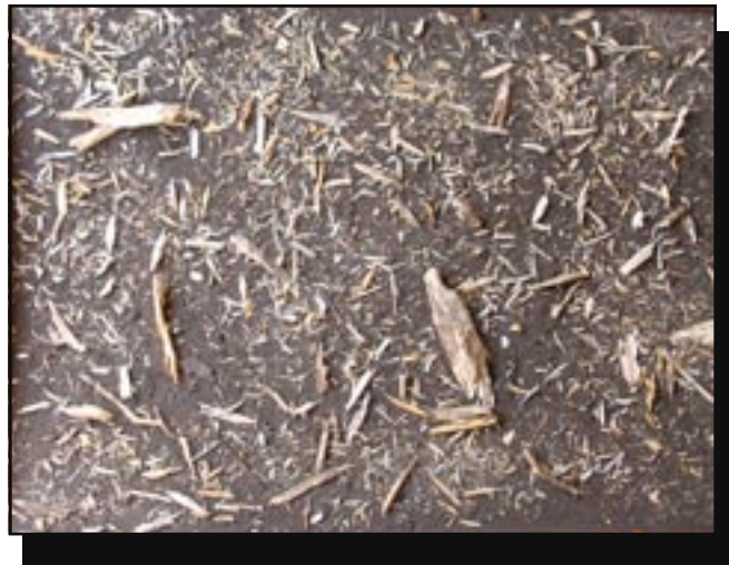
Figure 8—Shreddings providing 30-percent coverage.