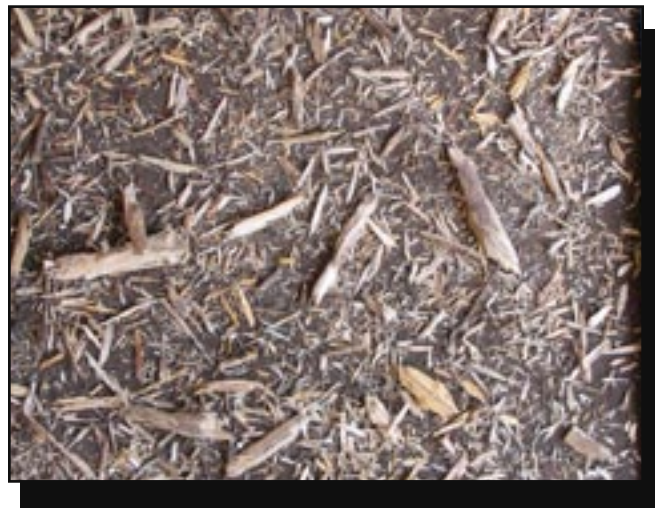
Figure 9—Shreddings providing 50-percent coverage.

shredding, that point was covered . The percent coverage is calculated by counting points covered by wood shredding material and dividing by the total number of points. Rainfall simulations were performed on coverages of 30, 50, and 70 percent (figures 8, 9, and 10) and tested with three repetitions. The results for each coverage rate were averaged.