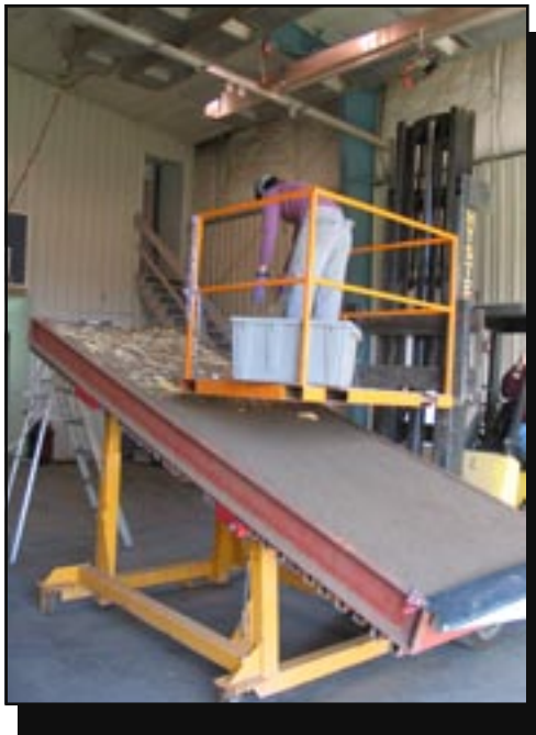
Figure 6—Spreading wood shavings on the soil test plot.