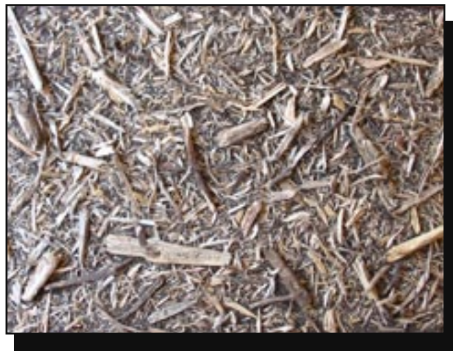
Figure 10—Shreddings providing 70-percent coverage.

The results showed that the shavings at 70-percent coverage reduced sediment loss by 98 percent. Burroughs and King (1989) estimated that straw mulch at 70-percent