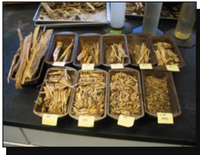
Figure 5—Samples of wood shavings sorted by size.

developed showing the relationship between percent coverage and the weight of the shavings. The shavings sample was sorted by size to determine its size distribution (figure 5).