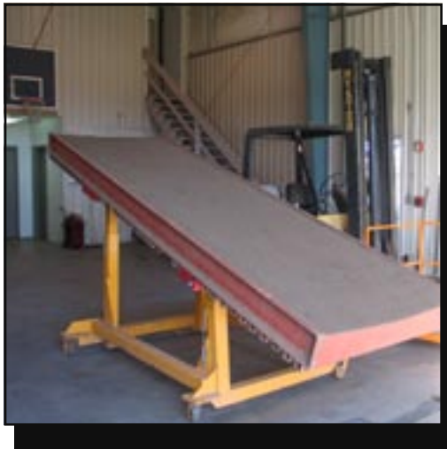
Figure 2—A steel frame with a soil test plot ready for wood shavings.

(2 inches per hour) of simulated rainfall. After 15 minutes, the flow distributor adds overland flow of 0.25 liter per minute. After 20 minutes, the overland flow is increased to 1 liter per minute. For further information, refer to Wood Strands as an Alternative to Agricultural Straw for Erosion Control by Randy B. Foltz and James H. Dooley (0423-1302P-SDTDC, http://www.fs.fed.us/eng/pubs/ ).