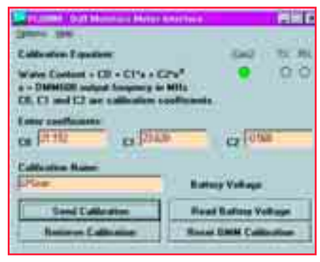
Figure 5—The PCDMM duff moisture meter interface software. A user-defined calibration curve, such as for gravimetric moisture content, can be added by setting the three calibration coefficients. The DMM600 display alternates between the standard volumetric moisture content and the user-defined calibration for each measurement.

A value for duff bulk density is needed for this calibration process. Fire managers may choose to use a known bulk density value or determine one from local conditions ( bulk density = dry weight ÷ vol ume ). Each coefficient in the standard calibration equation is divided by the bulk density. The three gravimetric coefficients are entered into the PCDMM software (fig. 5)