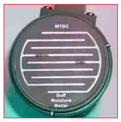
Figure 3—The bottom of the sample chamber is a printed circuitboard containing two interlocking finger sensor electrodes attached to a movable piston.

The factory-supplied calibration for the DMM600 is derived from laboratory measurements of the volumetric moisture content of duff from eight different forested sites. Depending on elevation, the cover species included Engelmann spruce ( Picea engelmannii ), subalpine fir ( Abies lasiocarpa ), lodgepole pine ( Pinus contorta ), western larch ( Larix occidentalis ), ponderosa pine ( Pinus ponderosa ), and Douglas-fir ( Pseudotsuga menziesii ). Because