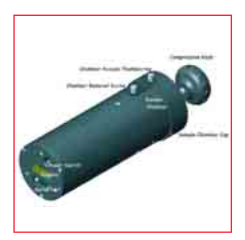
Figure 1— The duff moisture meter ( DMM600 ).

The fire manager collects a sample from the portion of the duff layer just above the soil mineral horizon and pushes it through a #4 mesh sieve that fits in the opening of the sample chamber (fig. 2). Passing the duff through the sieve breaks