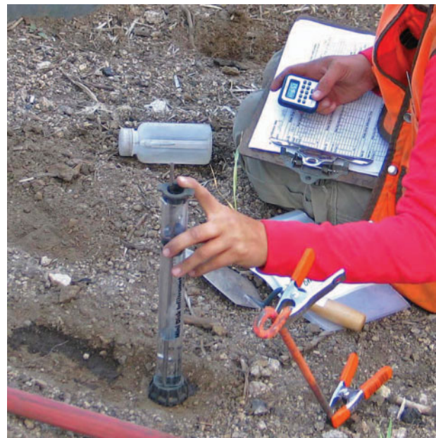
Fig. 2. Using the mini-disk infiltrometer in the field (from Robichaud et al. 2008).

The ease of using the MDI in the field has prompted ongoing efforts to correlate post-fire infiltration rates, as measured by rainfall simulation, to MDI measurements. Efforts to determine these correlations have been hindered by the large temporal and spatial variability of soil water repellency and post-fire infiltration rates as well as the relatively small number of post-fire