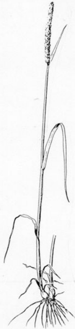
POACEAE (GRAMINEAE) Agrostideae Phleum pratense L. Phpr